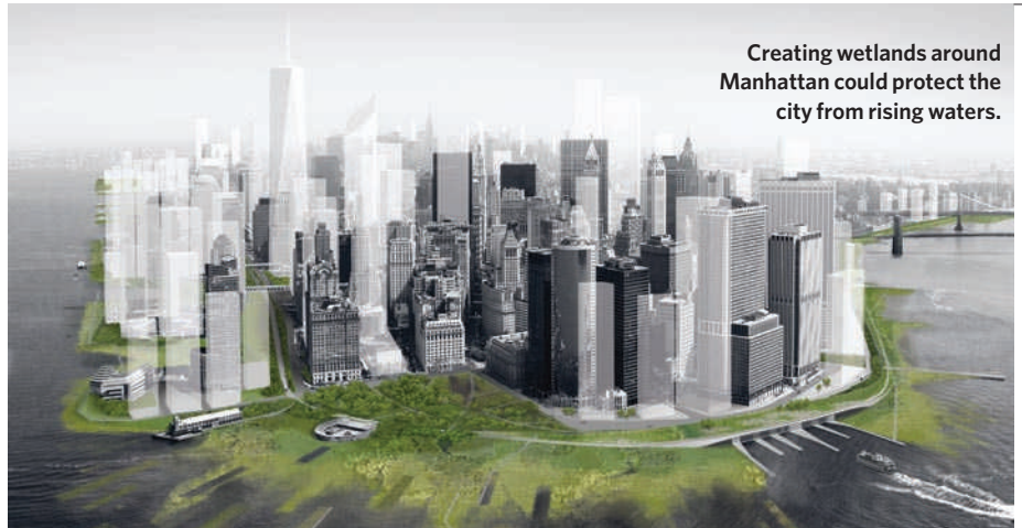
Creating wetlands around Manhattan could protect the city from rising waters.

satisfying. Detailing a range of beautiful and imaginative discoveries across the history of science, from Johannes Kepler’s determination of the laws of planetary orbits to elucidation of the structure of DNA, Glynn concludes that economy and creativity are the qualities that bring us most aesthetic pleasure.